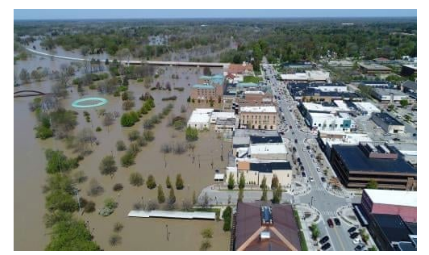
Severe flooding following the failure of the Edenville and Sanford Dams.