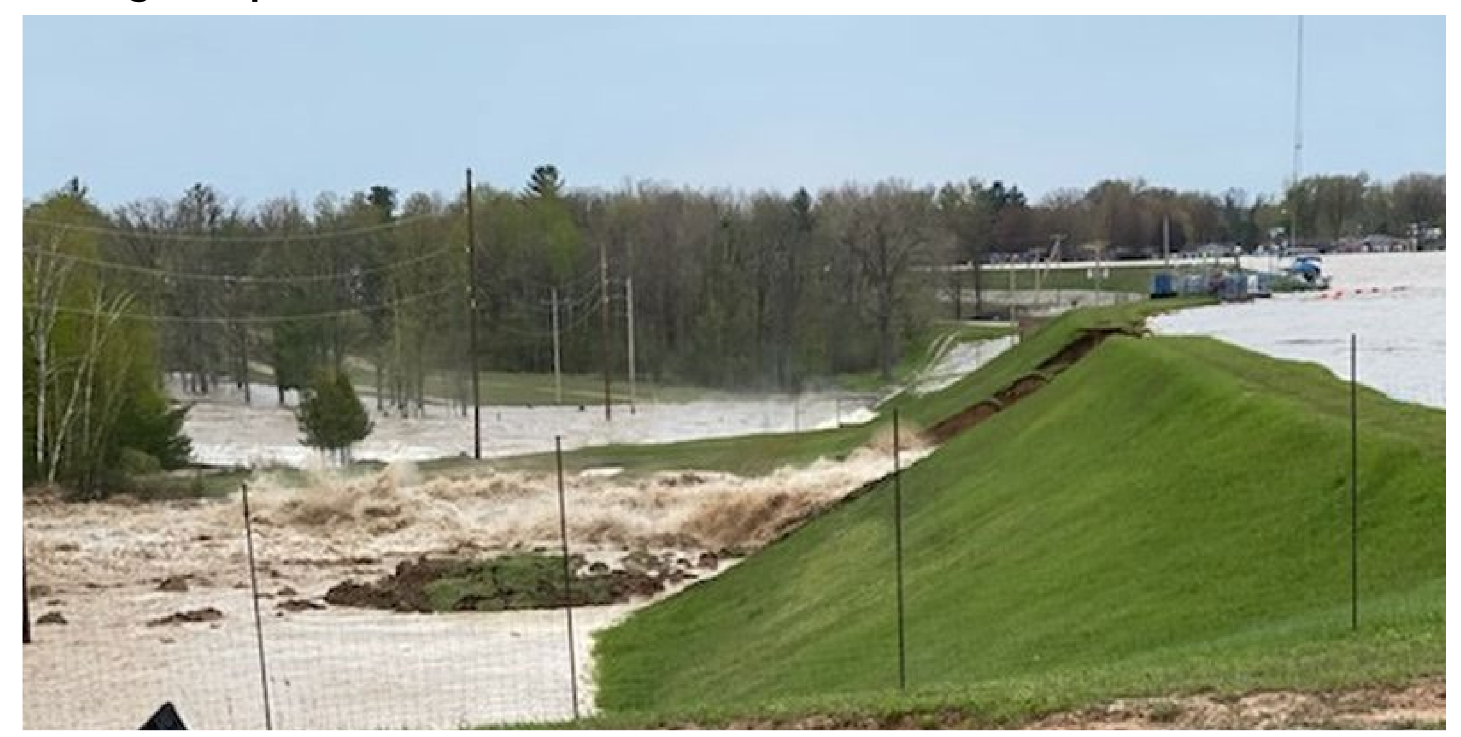
When the Edenville Dam failed during this rain event, it emptied 21.5 billion gallons of water downstream and emptied the lake in one hour.

When Gladwin County Road Commission replaced a failing CMP culvert with a precast box culvert under Wildwood Rd. in 2017, the precast box culvert endured the strength of the 500-year flood event in 2020 and prevented the 815-acre Secord Lake and Smallwood Lake from overflowing their berms, therefore preventing even more flooding than was originally experienced.