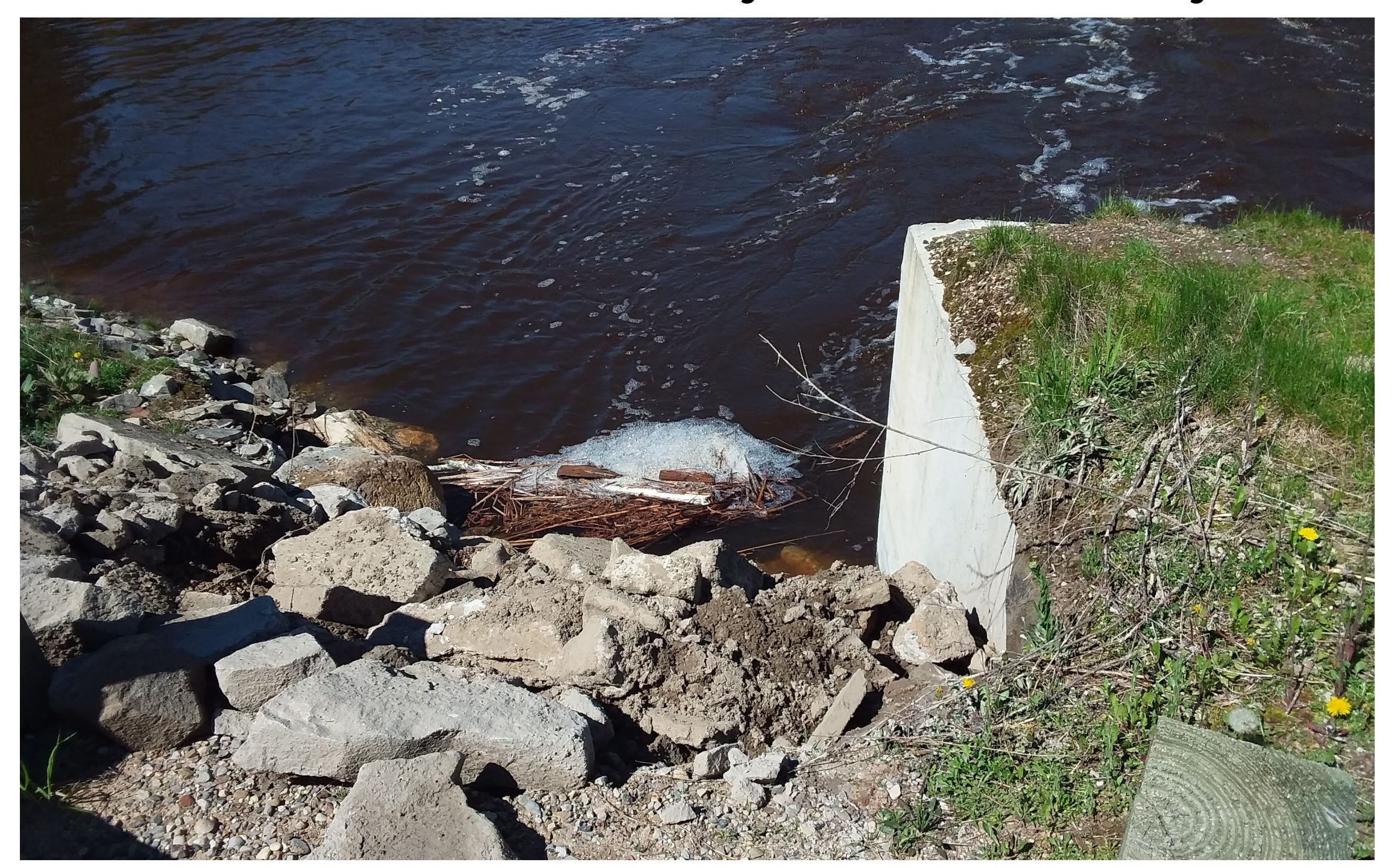
The Weight and Strength of the Precast Concrete Box Culvert kept Wildwood Road in place and prevented further flooding.