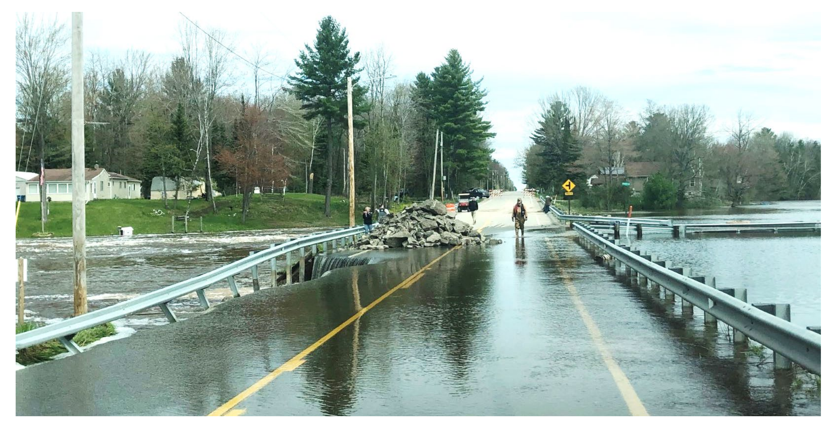
Gladwin County, MI, Wildwood Road (bermed roadway) was compromised during a 500-year flood event in May 2020.