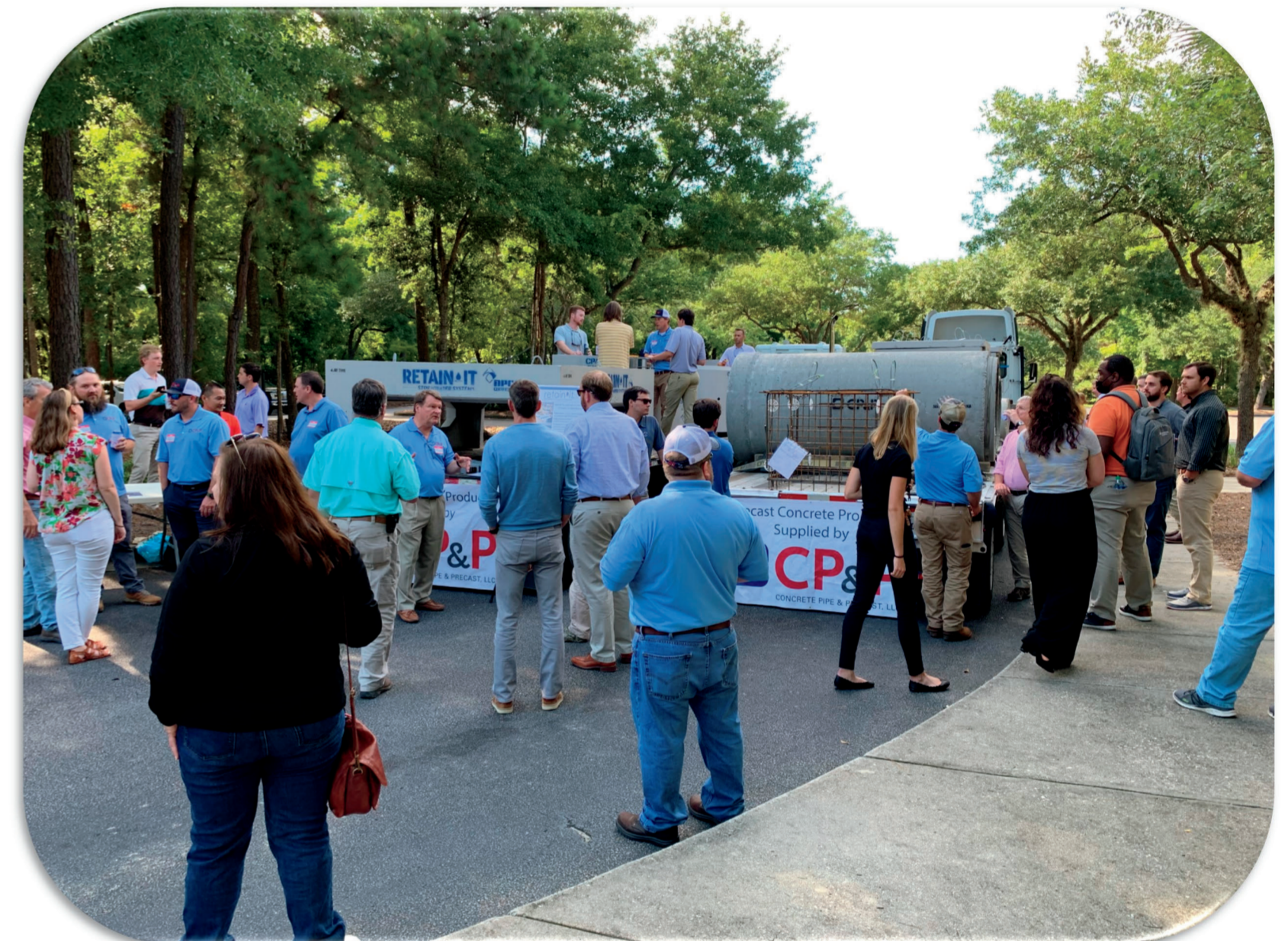
“Dine & Learn” – Hands on Product Training