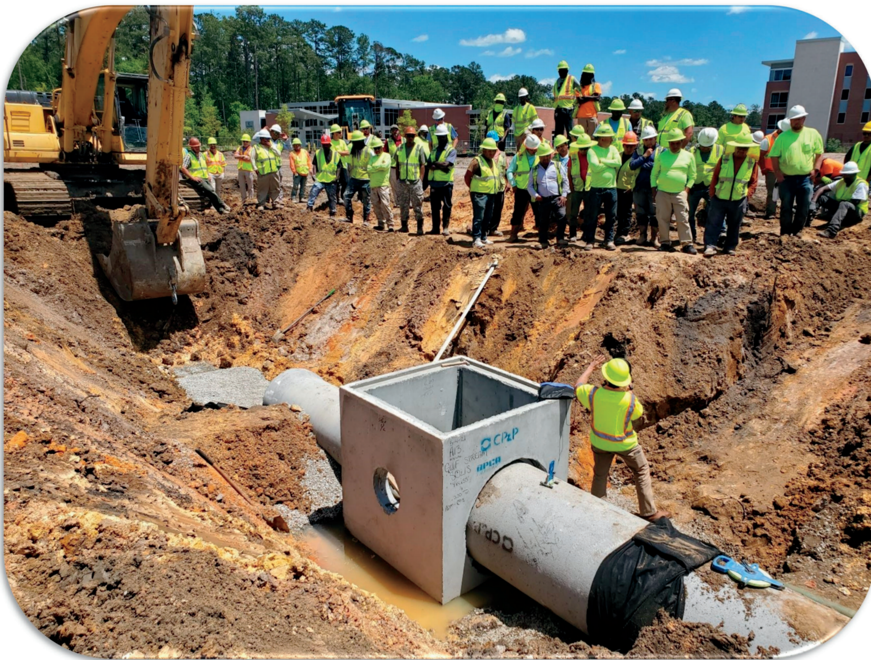
Installation Training with Contractors – In the Field