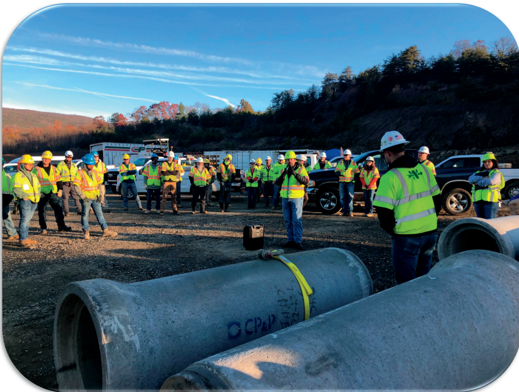
Inspection & Repair Training with Contractors In the Field