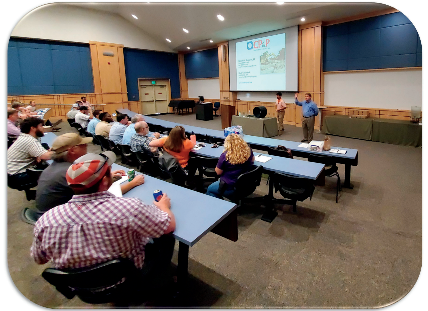
Full Day Installation Training with Owners, Inspectors, & Contractors Together