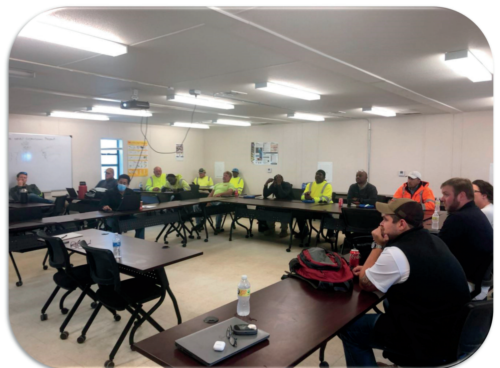
“Half Day” Installation Training with Contractors & Inspectors in Classroom

“We’ve noticed a significant decrease in deficiencies issued by QA/QC with no change in our rates of production. Particularly, clearing up what is and is not a repairable defect has eased a lot of issues.