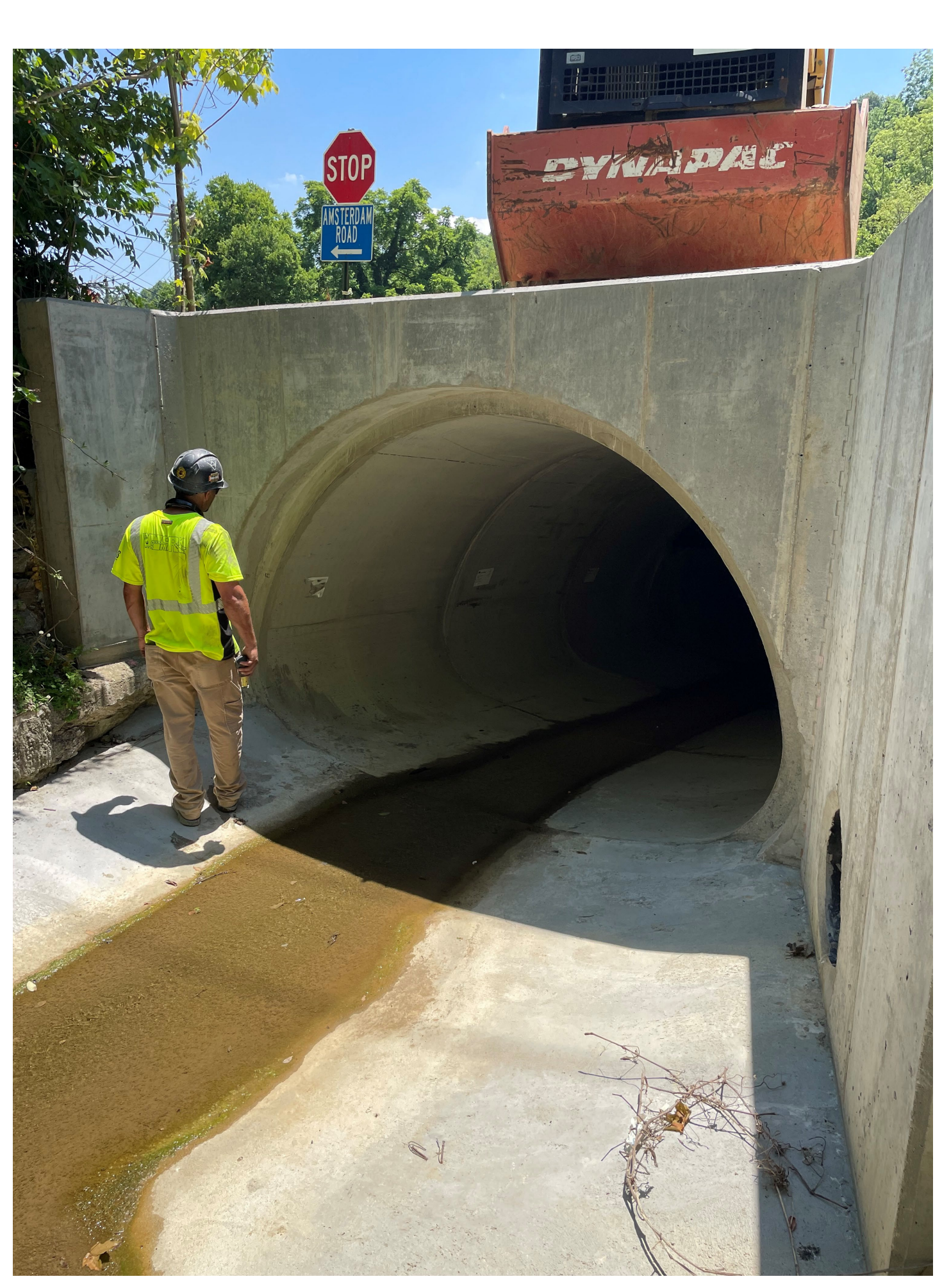
Bromley-Crescent Springs Rd. (KY2373) Kenton Co., KY | 102' of 96" Equivalent Concrete Arch Pipe