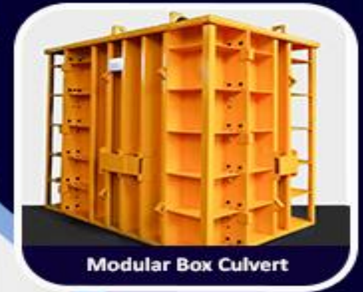
Modular Box Culvert